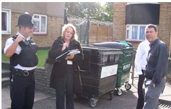
A Safer Neighbourhood Officer joins the inspection

We are working hard to improve your estate and we will take a zero tolerance approach to tenants found urinating in corridors or stairwells.