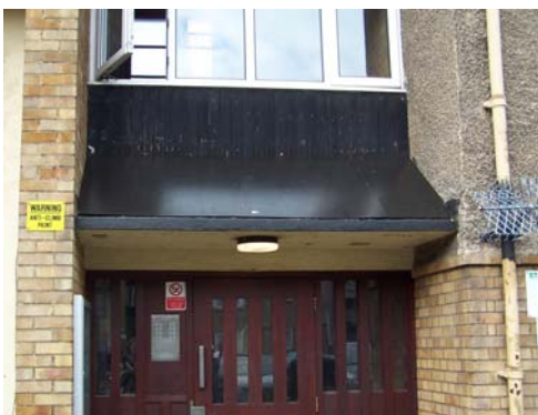
The new face of St Stephens Close

The inspection party consisted of residents, members of Ascham Homes including: Operations Team Leader, Estates Supervisor, Surveyor, Kier Site Manager and a Safer Neighbourhood Officer.