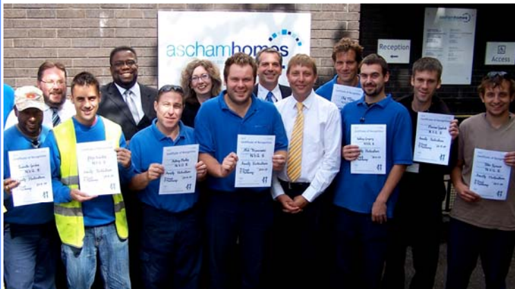
Our grounds maintenance staff celebrate passing their NVQ Level II in Amenity Horticulture 25/08/09

The Grounds Maintenance team from Ascham Homes revelled in their own success as sixteen members of staff received their certificates for NVQ Level 2 in Amenity Horticulture.