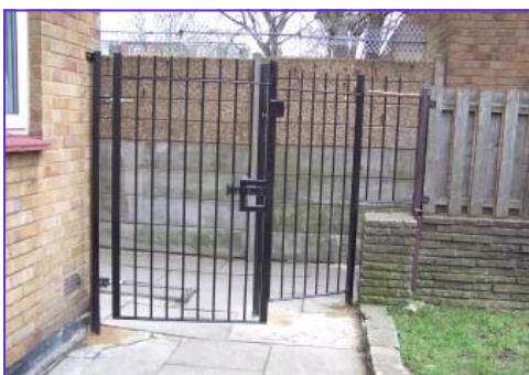
An access point to the rear of the estate

We are aware that residents on the estate would like the gate (shown in the photo opposite) to be locked.