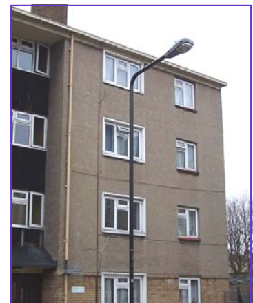
A street light

We have reported the street light which doesn't work and the other lights to Waltham Forest Highways.