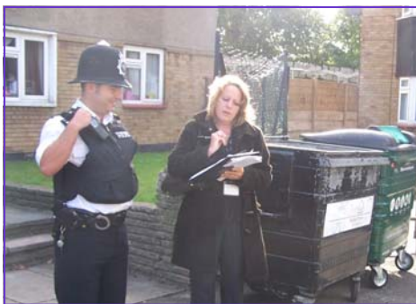
A photo taken at the rear of the estate

The residents and the Safer Neighbourhoods Officer on the inspection informed us that antisocial behaviour was on the increase, especially towards the rear of the estate.