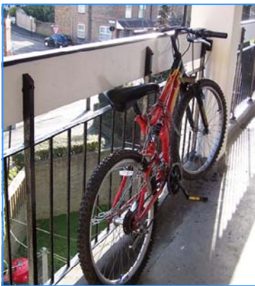
A bike left in a communal area

Resident are reminded not to leave personal belongings in corridors this includes push bikes and motorbikes.