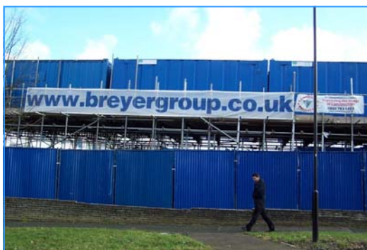
Breyer's site office and storage area

We would like to apologise for the error in the October newsletter, where we published that Breyer would have finished the decent homes work in December.